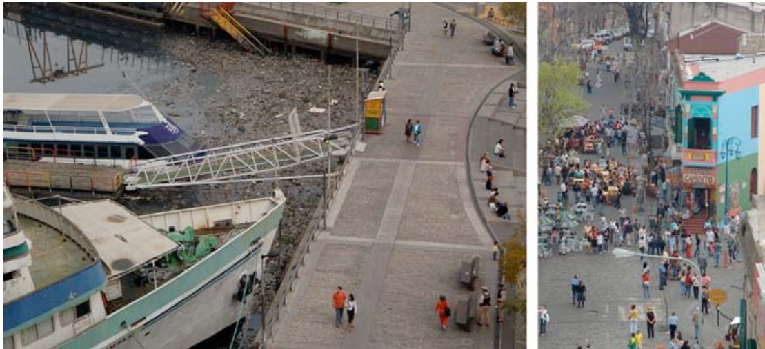
Photos of La Boca, Buenos Aires

Paintings by Argentine artist Benito Quinquela Martín evoke the life of the docks and La Boca (the mouth of the river), famous today for soccer and as one (not the only) early homes of Tango. The brightly painted facades of the modest residences reflect a Genoese immigrant ancestry. Here you will find the outdoor street artist tango 'museum', frequented by hopeful tango buskers and touts. You can still buy frozen goods at one of the refrigeration plants that played such an important role in the export and meatpacking industries.