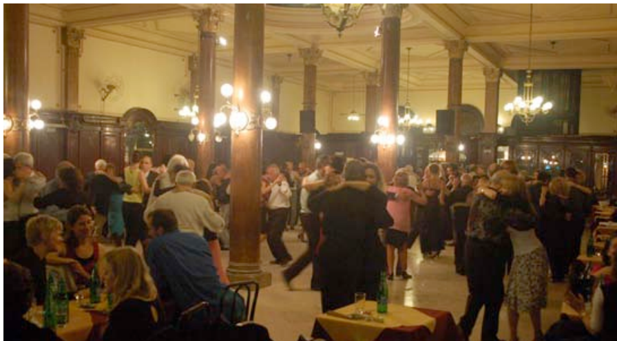
Photo: Confiteria Ideal Milonga, Buenos Aires

It is a good thing to be reminded of this occasionally, when intolerance of difference rears its ugly head. Put yourself into the shoes of the new arrival or the outsider when they come to your country, your class or your milonga. Smile a welcome with your eyes. Recognise a different kind of beauty. Dance with a newcomer.