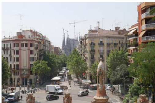
View along Avenida Gaudí, towards the Sagrada Família