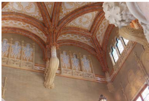
Detail in the St Pau Hospital, designed by Domenech i Montaner

The Moors conquered Barcelona in 717 AD and remained in power for just 80 years. There are almost no Moorish remains, but Arabic influences are obvious in early 20 th century Modernisme , in building materials, brickwork, decorative tiling and garden design.