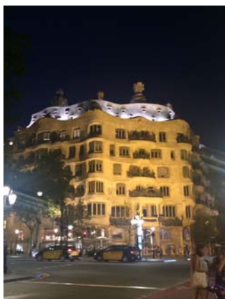
Gaudí by night, Passeig de Gràcia

We've just been there, sharing our passion for the city and its people with friends, who came to learn tango with us and stepped quickly into our circle of friendship. On past visits, we've gone to milongas, but, on this occasion, we opted to spend our evenings together, enjoying one another's company, the local atmosphere, and great food, beer and wine at little bars and restaurants close to where we were staying, on the street graced by Gaudí's Casa Milá (la Pedrera) , Casa Batlló , and other fine examples of the style of Modernisme .